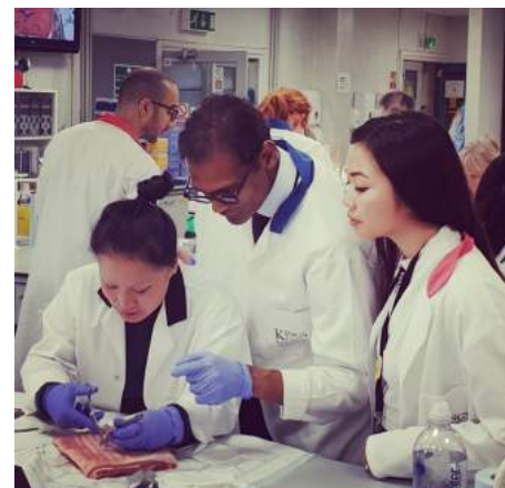
Skin Biopsy Course small group teaching

We are delighted to announce our 5 th Skin Biopsy Course for Nurses is open for registration and will take place on 4 th -5 th June 2020 in the Gordon Museum, Guy's Campus, London. Numbers on the course are limited to 20 to ensure everyone benefits from small group teaching and maintain excellent quality.