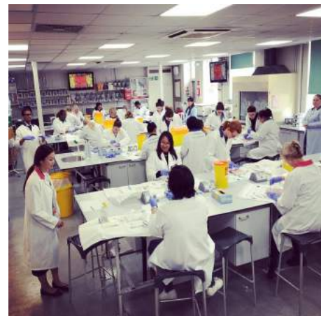
Skin Biopsy Course practical session